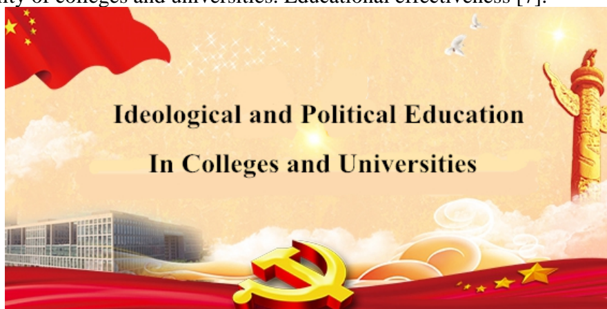
Fig1. The Goal of Ideological and Political Education in Colleges and Universities

Through active education in colleges and universities, it helps to introspect and analyze the shortcomings and deficiencies in traditional education. Apart from helping college students correct their own shortcomings and deficiencies, it can also tap into the potential positive qualities and qualities of undergraduates, and aim to cultivate them in practical activities. 6]. In active education, a positive and healthy teaching environment should be created to encourage students to give full play to their subjective initiative, rather than over-controlling them. Otherwise, college students can easily develop resistance. Under the guidance of the theory of positive psychology, to promote the psychological state of college students to reach an ideal stage, is based on the actual situation of different individuals set goals, but not exactly the same. Through active psychological therapy, we can focus on the problems that oppose the past in the application of positive psychology, and devote more energy to strengthening the positive forces of human-to-human relationships. In current active psychological treatment methods, Daoism, Buddhism, and other thoughts are incorporated, and efforts are devoted to solving the positive aspects of troubles and conflicts, deepening self-awareness and understanding, establishing self-trust and safe life patterns, and contributing to enhancing the positive mentality of colleges and universities. Educational effectiveness [7].